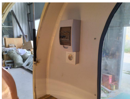
- Electrical System -