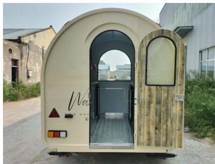
- Door -