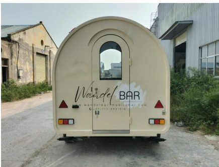
- Door -