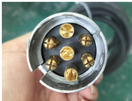
- 7 Pin Trailer Connector -