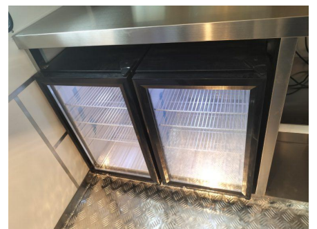
- Fridge -