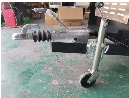
- Tow Bar -